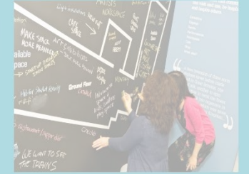
Picture 9. Derby Museums Consultation Activity